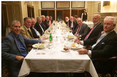
The CDS Class of 1970 enjoyed dinner together at a mini-reunion.